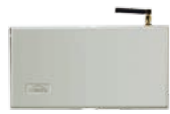
P8-GWD GDS Router